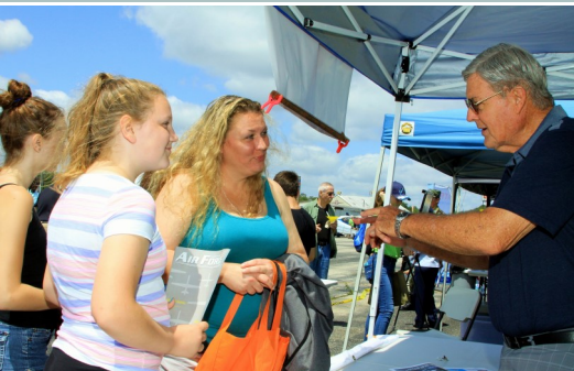
Aerospace Ed Program in the community.