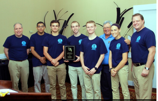
State Award, Top Open Division, 2016 Wizard Squad, Winter Springs HS

security and other STEM disciplines, help students understand the importance of cybersecurity, introduce students to cybersecurity principles and equip students to better protect themselves on the Internet. What can the Falcon Chapter do to help?