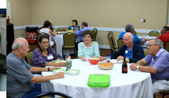
After hours enjoyed at the Hospitality Suite