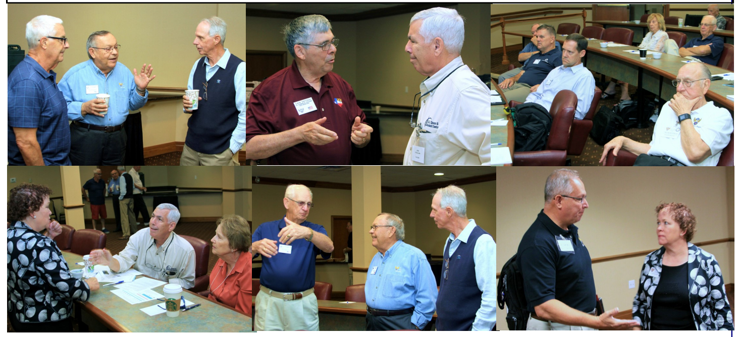
Air Force Association Annual National Convention Sept 17-18, 2016

(Below) Attendees break for side discussions - cross tell and a look at Florida Chapters around the state!