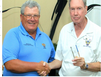
AFA Florida Chapter 399 Member of the Year 2016

These Falcon Team members were identified by their fellow members for their sustained performance in support of the Falcon Chapters activities. It included out reach to the Northeast Area communities and business in promoting AFA Aerospace Education Programs and community partnering. Their interaction with Civil Air Patrol units, the local AFJROTC units, and veteran organizations were also identified in their activities.